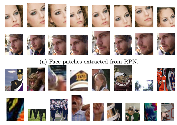
(b) Non-face patches extracted from RPN.

Fig. 1. Sample proposals generated by RPN. When the IOU between a face proposal generated by RPN and a ground-truth label is greater than 0.5, we treat it as a face patch. Otherwise, when the IOU is below 0.3, we treat it as a non-face patch.